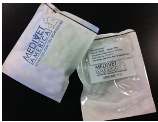
Left/Right: Stem Cells with NanoScaffolding at 48 hours using SEM imaging/MediVet NanoScaffold in sterile packaging.

The MediVet NanoScaffold matrix consists of FDA-approved injectable polymers that are 1/200th the size of a strand of human hair. These nanofibers align to guide cell orientation, cell migration, and/or modify mechanical properties, which increases cellular localization in area of ailment. When combined with stem cells and injected into areas with arthritis, joint damage, or muscular adhesions, etc., in vivo resorption period is approximately 6 weeks.